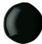
244 IVORY BLACK PBk9 SI ■ ☀