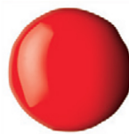
983 FLUORESCENT RED S2 □ ☀