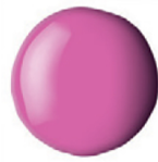
500 MEDIUM MAGENTA PW6 • PR122 SI ■ ☀