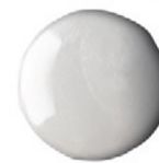
238 IRIDESCENT WHITE S2 ■ ☀