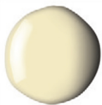
434 UNBLEACHED TITANIUM PW6 • PY42 • PBk11 • PR101 SI ■ ☀