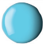
770 LIGHT BLUE PERMANENT PW6 • PG7 • PB15:3 SI ■ ☀