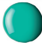
660 BRIGHT AQUA GREEN PG7 • PW6 SI ■ ☀