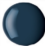
310 PAYNE'S GRAY PBk9 • PBk29 • PR122 SI ■ ☀