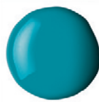
046 TURQUOISE BLUE PG7 • PB15:3 • PW6 SI ■ ☀