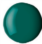
317 PHthalocyanine GREEN PG7 SI ■ ☀