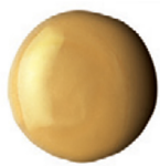
051 GOLD S2 ■ ☀