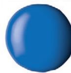
984 FLUORESCENT BLUE S2 ■ ☀