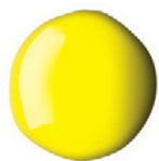
159 CADMIUM YELLOW LIGHT HUE PY3 SI ■ ☀