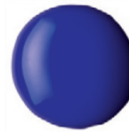
380 ULTRAMARINE BLUE PB29 SI ■ ☀