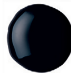
276 MARS BLACK PBk11 SI ■ ☀