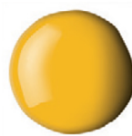
163 CADMIUM YELLOW DEEP HUE PY83 • PW6 SI ■ ☀