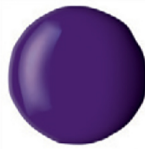
186 DIOXAZINE PURPLE PV23 RS SI ■ ☀