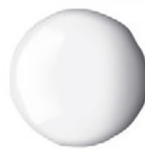
432 TITANIUM WHITE PW6 SI ■ ☀