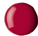
116 ALIZARIN CRIMSON HUE PERMANENT PR179 • PR202 • DPP SI ■ ☀