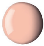
810 LIGHT PINK PW6 • PO36 • PR188 SI ■ ☀