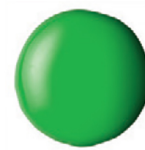
985 FLUORESCENT GREEN S2 □ ☀