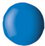
470 CERULEAN BLUE HUE PB29 • PB15:3 • PG7 • PW6 SI ■ ☀