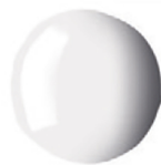
430 TRANSPARENT MIXING WHITE PW4 SI □ ☀