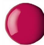
311 CADMIUM RED DEEP HUE PR170 • PV19 SI ■ ☀