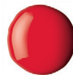
292 NAPHTHOL CRIMSON PR170 SI ■ ☀