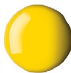
830 CADMIUM YELLOW MEDIUM HUE PY74 • PY83 SI ■ ☀