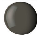
331 RAW UMBER PO73 • PY139 • PB29 SI ■ ☀