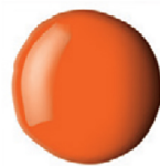
982 FLUORESCENT ORANGE S2 □ ☀