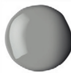
599 NEUTRAL GRAY 5 PY42 • PBk9 • PW6 SI ■ ☀