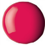
415 PRIMARY RED PV19 SI ■ ☀