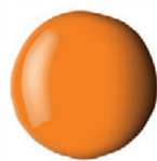
720 CADMIUM ORANGE HUE PO73 SI ■ ☀