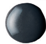
049 IRIDESCENT GRAPHITE Mica • PBk7 S2 ■ ☀