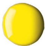
410 PRIMARY YELLOW PY74 SI ■ ☀