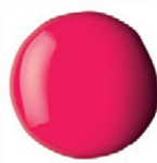
987 FLUORESCENT PINK S2 □ ☀