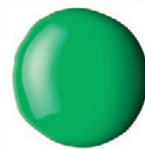
312 LIGHT GREEN PERMANENT PG7 • PY74 • PW6 SI ■ ☀