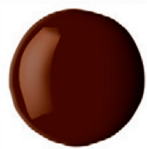
128 BURNT UMBER PB7 SI ■ ☀