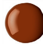
127 BURNT SIENNA PBk9 • PR101 SI ■ ☀