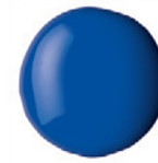
316 PHthalocyanine BLUE PB15:3 SI ■ ☀