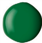
224 HOOKER'S GREEN HUE PERMANENT PG7 • PBk9 • PY74 SI ■ ☀