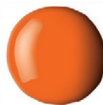
620 VIVID RED ORANGE PO73 • PY139 SI ■ ☀