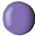
590 BRILLIANT PURPLE PW6 • PV23 RS SI ■ ☀