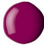
114 QUINACRIDONE MAGENTA PR122 SI ■ ☀