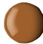
330 RAW SIENNA PY42 • PR101 • PBk9 SI ■ ☀