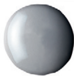
052 SILVER S2 ■ ☀