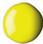
981 FLUORESCENT YELLOW S2 □ ☀